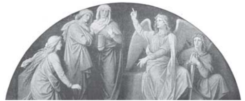
He is risen ... Happy Easter!