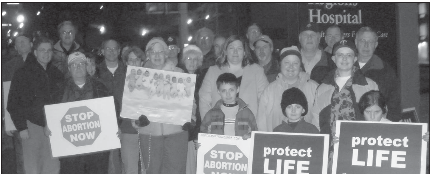
On March 15, more than 25 KC's and family members gathered to pray the Rosary for an hour in the front of Regions Hospital on Jackson St. in St. Paul. Fellow KC's and parishoners from East Side Catholic churches gathered on March 13 to pray the Rosary from 5 a.m. til 9 p.m. Many rosaries were prayed that day and many people took time to honk their horns and show they also support life. The group will be out in full force April 5th for the final Sunday during Lent.