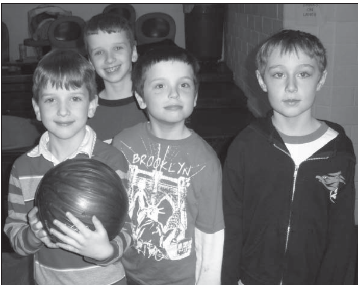
These future KC squires were thankful for the lane bumpers to boost their egos and their score.

Beside the sloppy Joe's, chips and drinks provided by the council, there were delicious potluck dishes to share; from salads to desserts. Free bowling and free food. It just doesn't get any better than that!