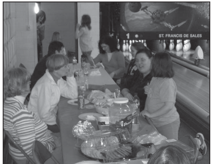
The bowling lanes filled up quickly and the buffet items and sloppy Joe's filled everyone else.