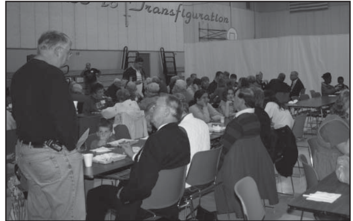
The KC's and family members served a hearty meal to 160 veterans and their families on Nov. 11 at Transfiguration's gym.

Transfiguration Church celebrated Veteran's Day with a program called "Reflections on Faith, Service: Now and Then."