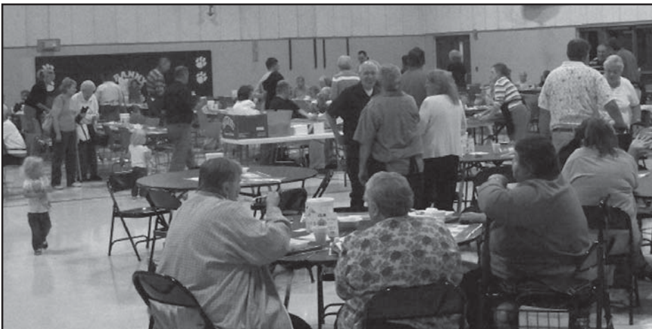
The council served hundreds at Transfiguration's Pancake Breakfast on Sept. 7. Many thanks goes to Denny's Restaurant (I-94 and Hwy. 120) for its donation of pancake batter, eggs and syrup. Be sure to stop into Denny's and say "thanks!"